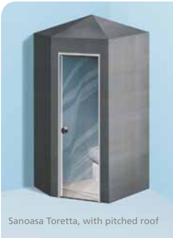
Sanoasa Toretta, with pitched roof