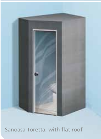
Sanoasa Toretta, with flat roof