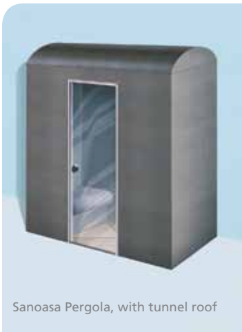
Sanoasa Pergola, with tunnel roof