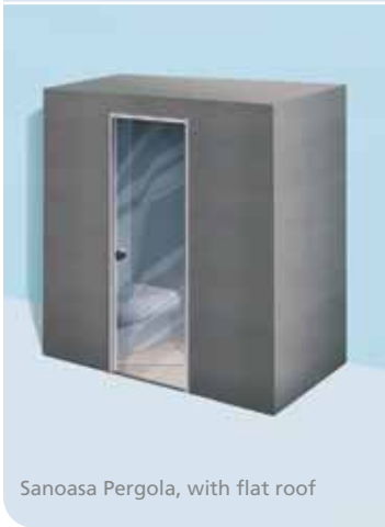
Sanoasa Pergola, with flat roof