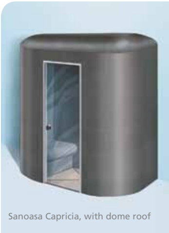
Sanoasa Capricia, with dome roof