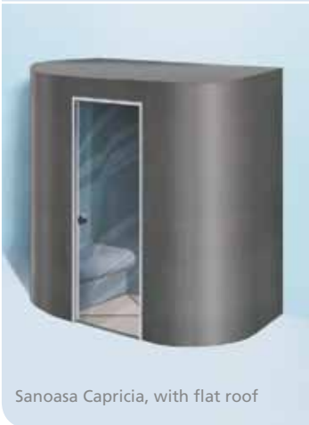
Sanoasa Capricia, with flat roof