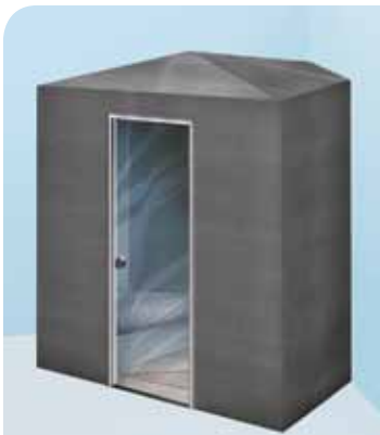
Sanoasa Bicocca, with pitched roof