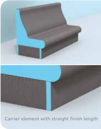
Carrier element with straight finish length