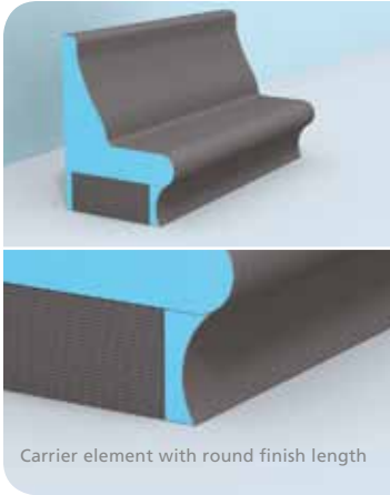
Carrier element with round finish length